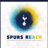
Spurs REACH Race, Ethnicity, Culture, and Heritage