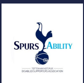
Spurs Ability Supporters with disabilities