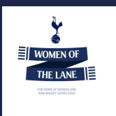
Women of the Lane Women and non-binary fans of the men's team