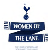
Women of the Lane Women and non-binary fans of the men's team