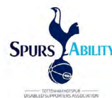
Spurs Ability Supporters with disabilities