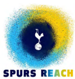
Spurs REACH Race, Ethnicity, Culture, and Heritage