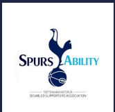
Spurs Ability Supporters with disabilities